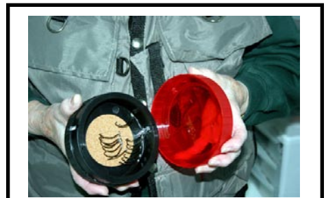
Having your hook and leader set up all rigged and ready means more time with your lure in the water. It also means you've got a better shot at catching fish than other anglers who aren't as well prepared.

Mack's Lure's Pip's Leader Caddy as well as its Pip's Box are made to order for the guy who is serious about advance preparation. If I rig up drift bobber rigs and perhaps leaders that have two hooks, all I have to do is store them in the Pip's Leader Caddy. The Leader Caddy is a magnum version of the smaller Pip's Box.